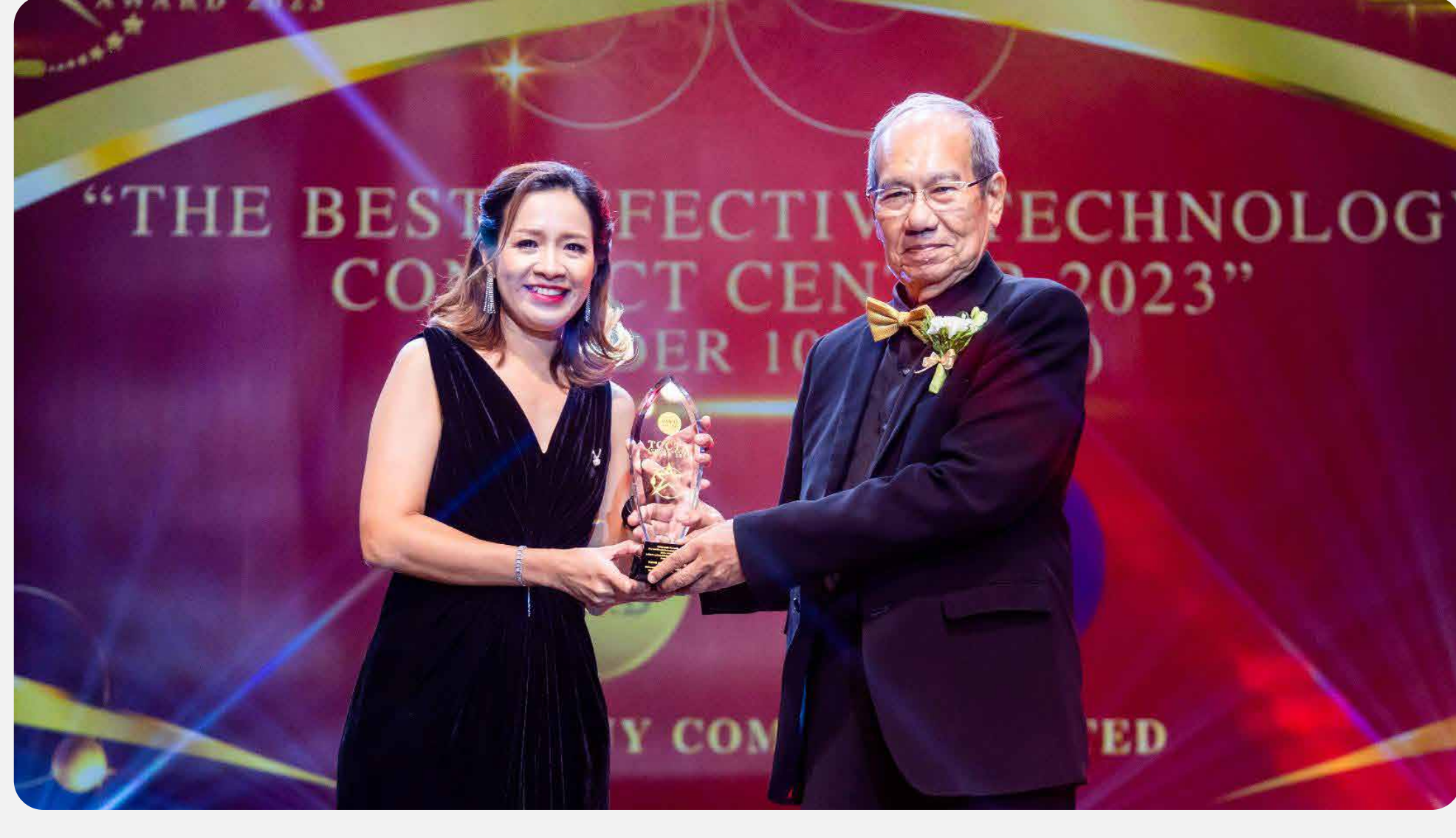
Power Buy won the "TCCTA Contact Centre Awards 2023"