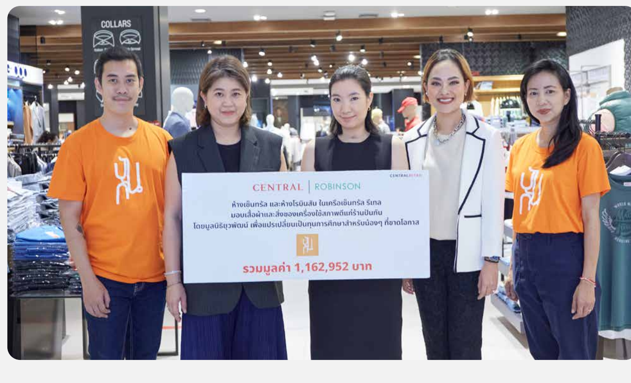
Central and Robinson donate goods and used clothes in good condition to Pankan by Yuvabadhana Foundation