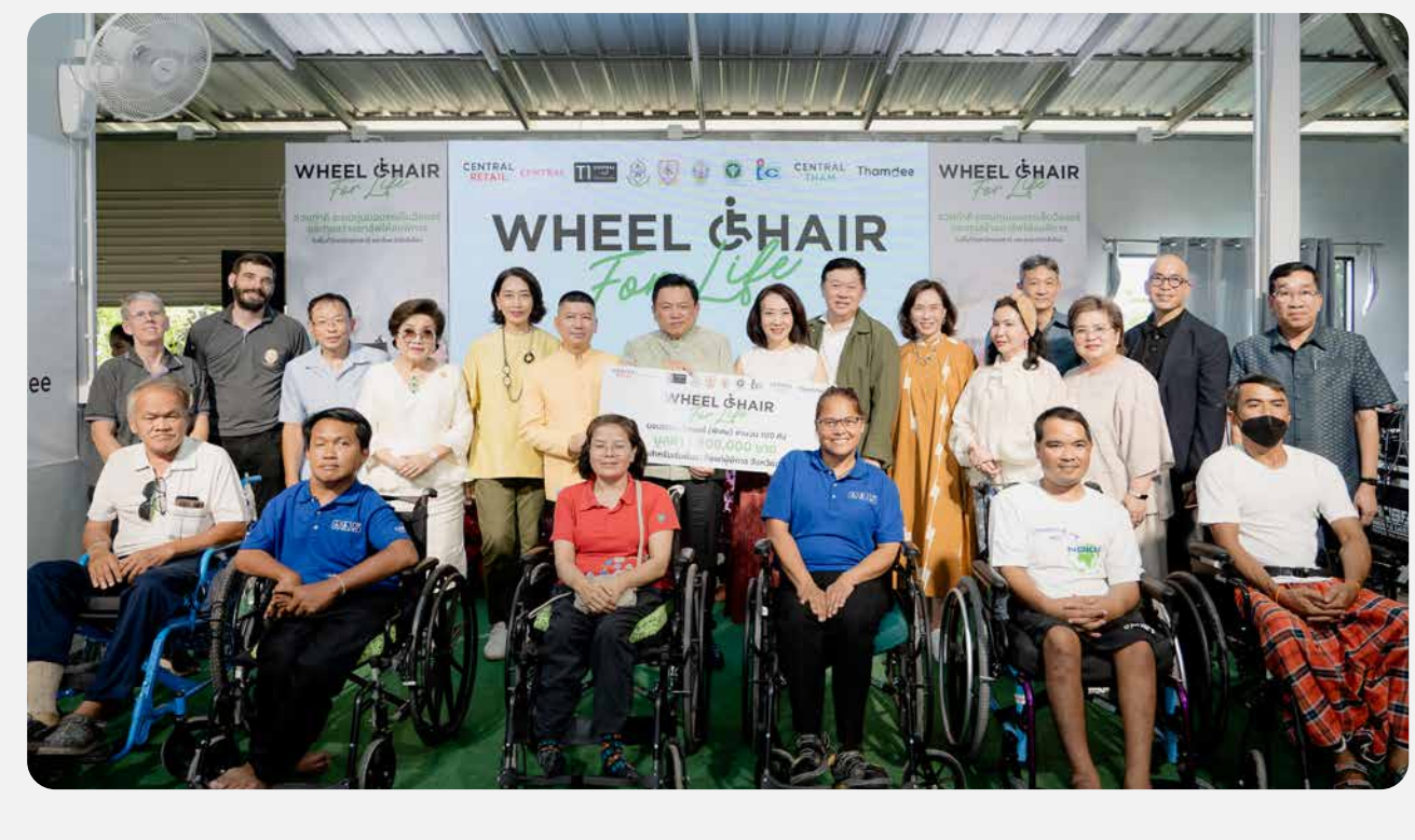
Central invites VVIC customers to donate wheelchairs to people with disabilities to foster a lasting quality of life