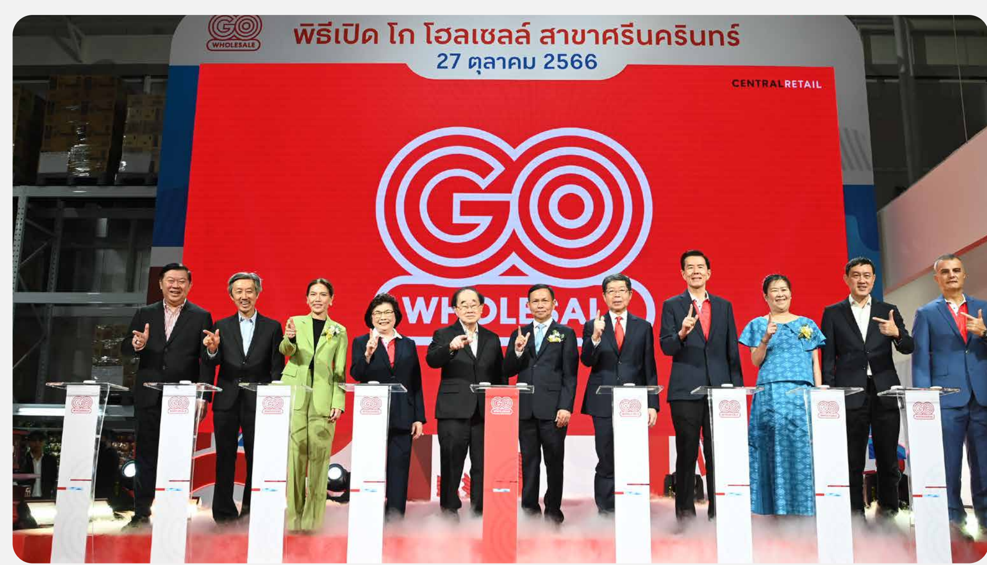
Now Open! GO Wholesale Srinakarin-Thailand's new wholesale business highlighting a large-scale food product and service hub