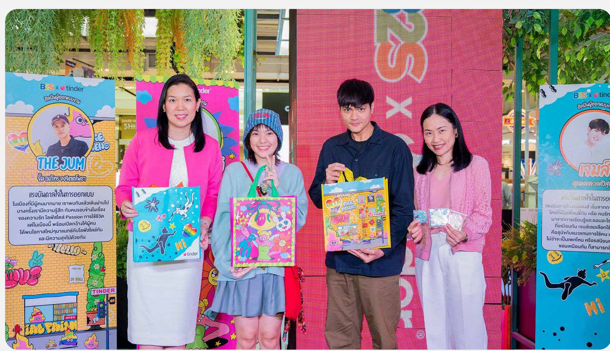
B2S x Tinder to launch a new campaign, "It Starts With a Swipe"