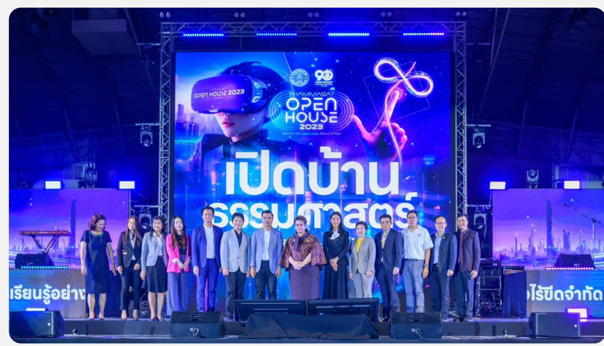
Central Retail, the primary sponsor of Thammasat Open House 2023, is garnering positive attention for its commitment to being a "Green & Sustainable Retail"