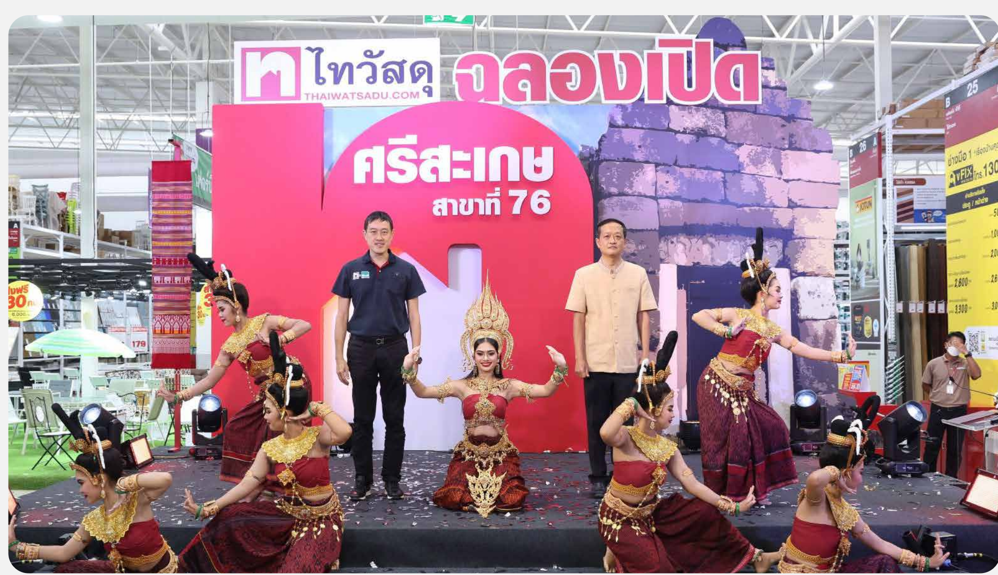
Thaiwatsadu starts ambitious 4 th quarter expansion, targeting growth in Southern Isaan region