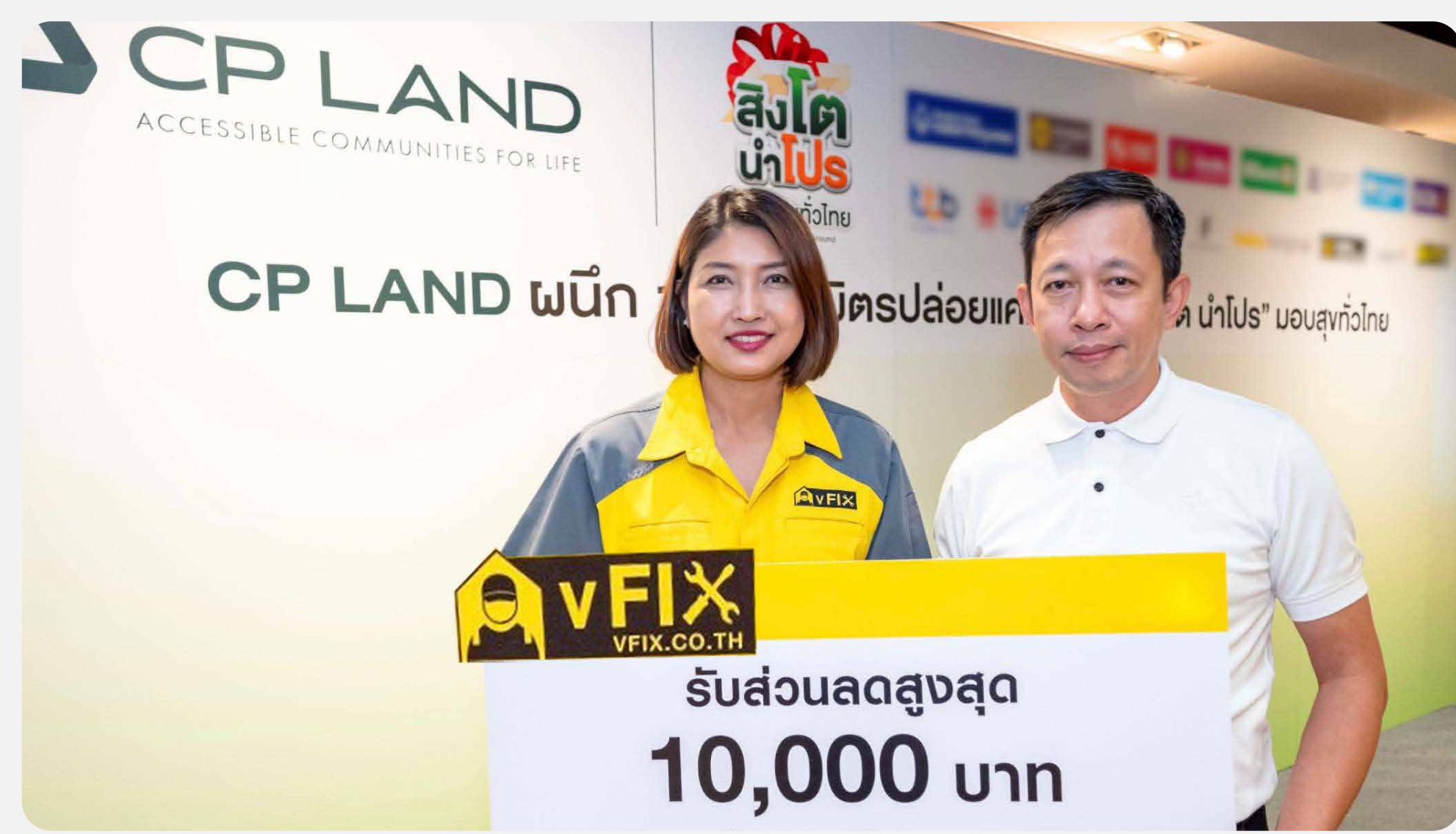
vFIX offers "One-Stop" renovation services with up to THB 10,000 savings for "CP Land" residents