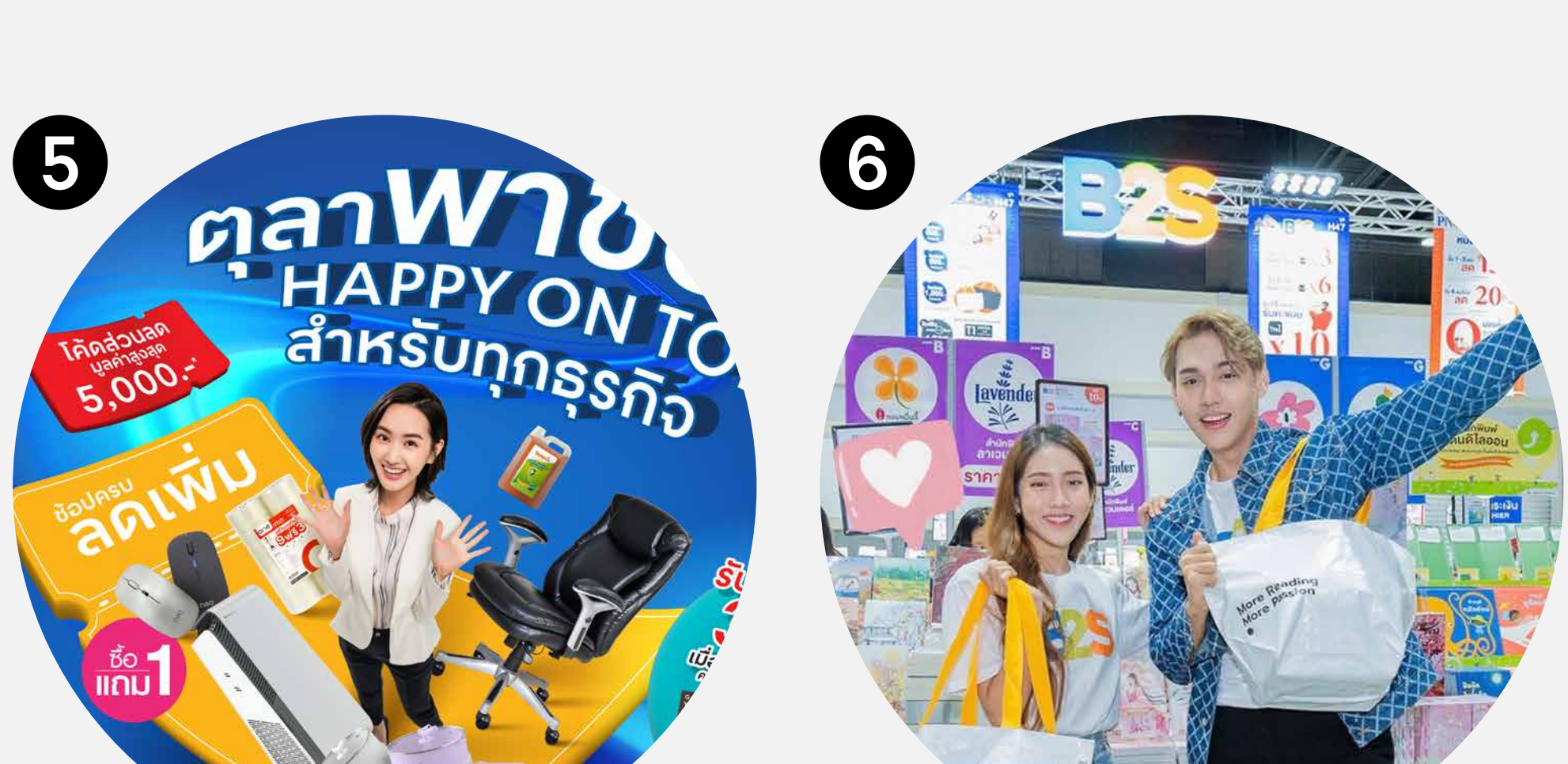
5 OfficeMate supports cost reduction for businesses. Enjoy exclusive discount codes and vouchers throughout October 2023