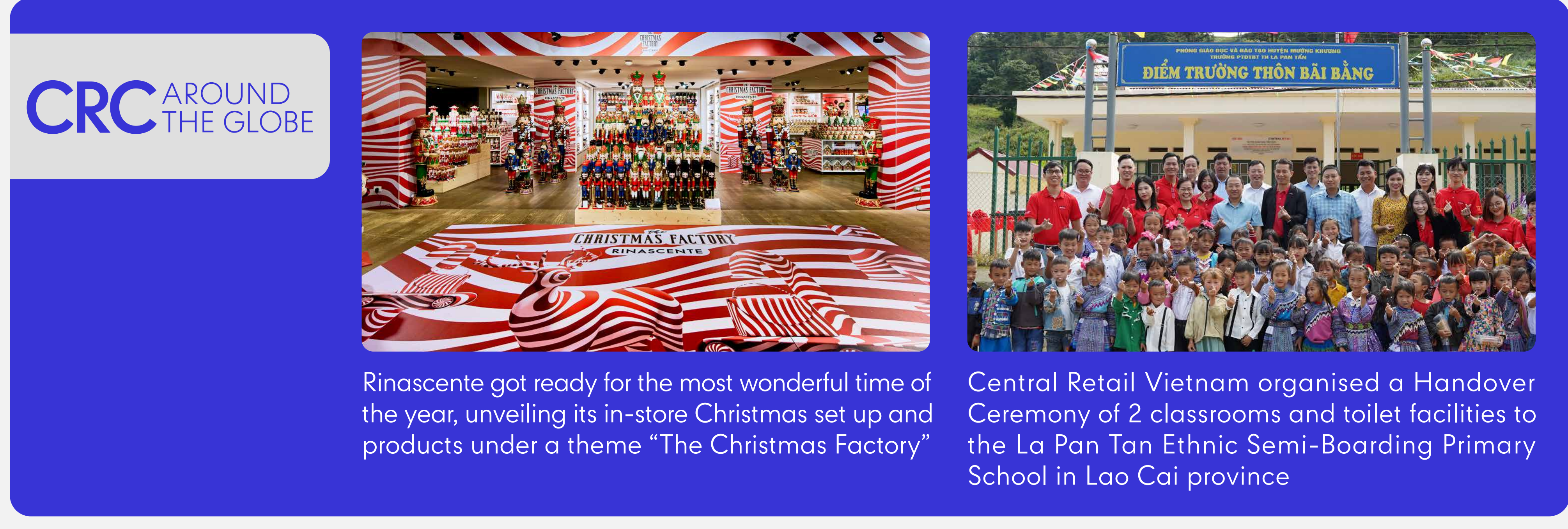
CRC AROUND THE GLOBE Rinascente got ready for the most wonderful time of the year, unveiling its in-store Christmas set up and products under a theme "The Christmas Factory"