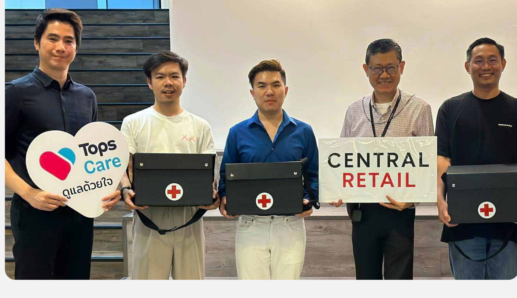
Tops Care sponsored medicine and first kits in "CRC League 2023"