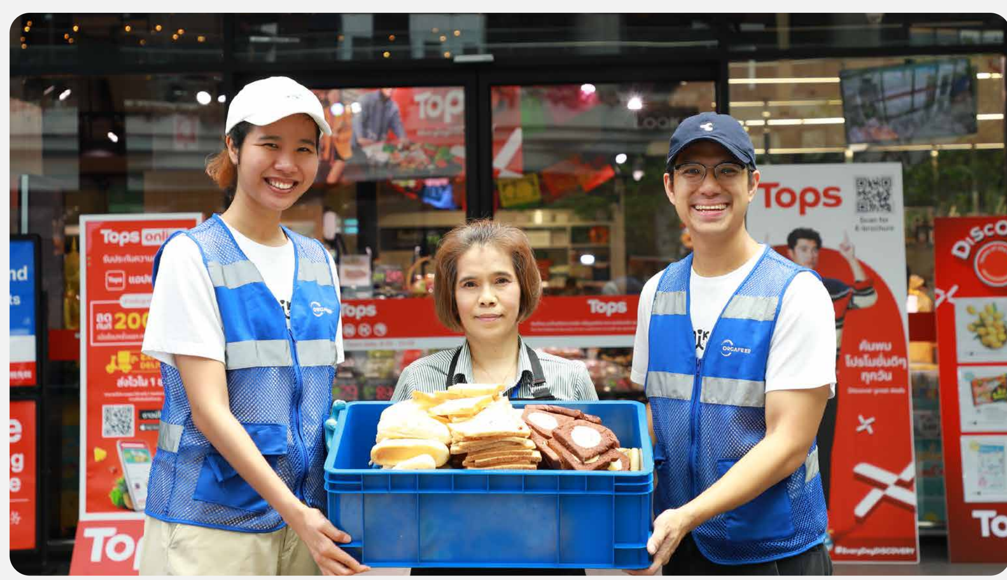
Tops partners with "Jaikla" to drive 360° circular economy concept