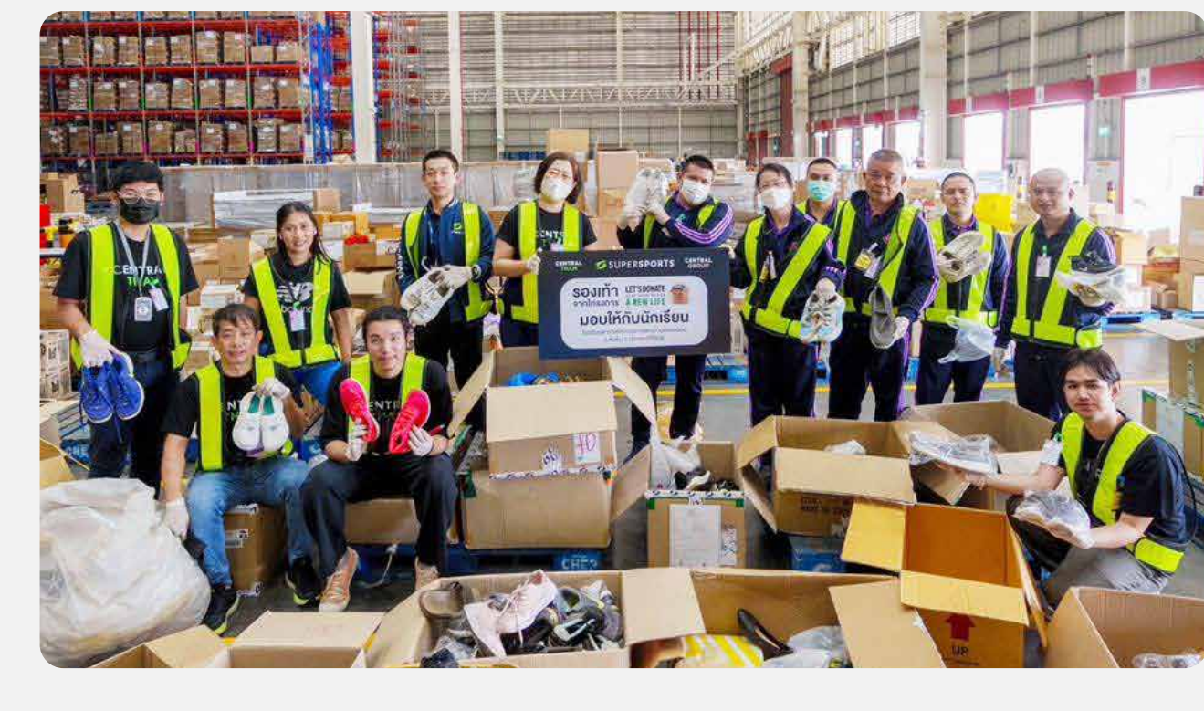
Supersports offers youth development opportunities in remote areas with the 10 th "Let's Donate! Give Your Shoes A New Life"