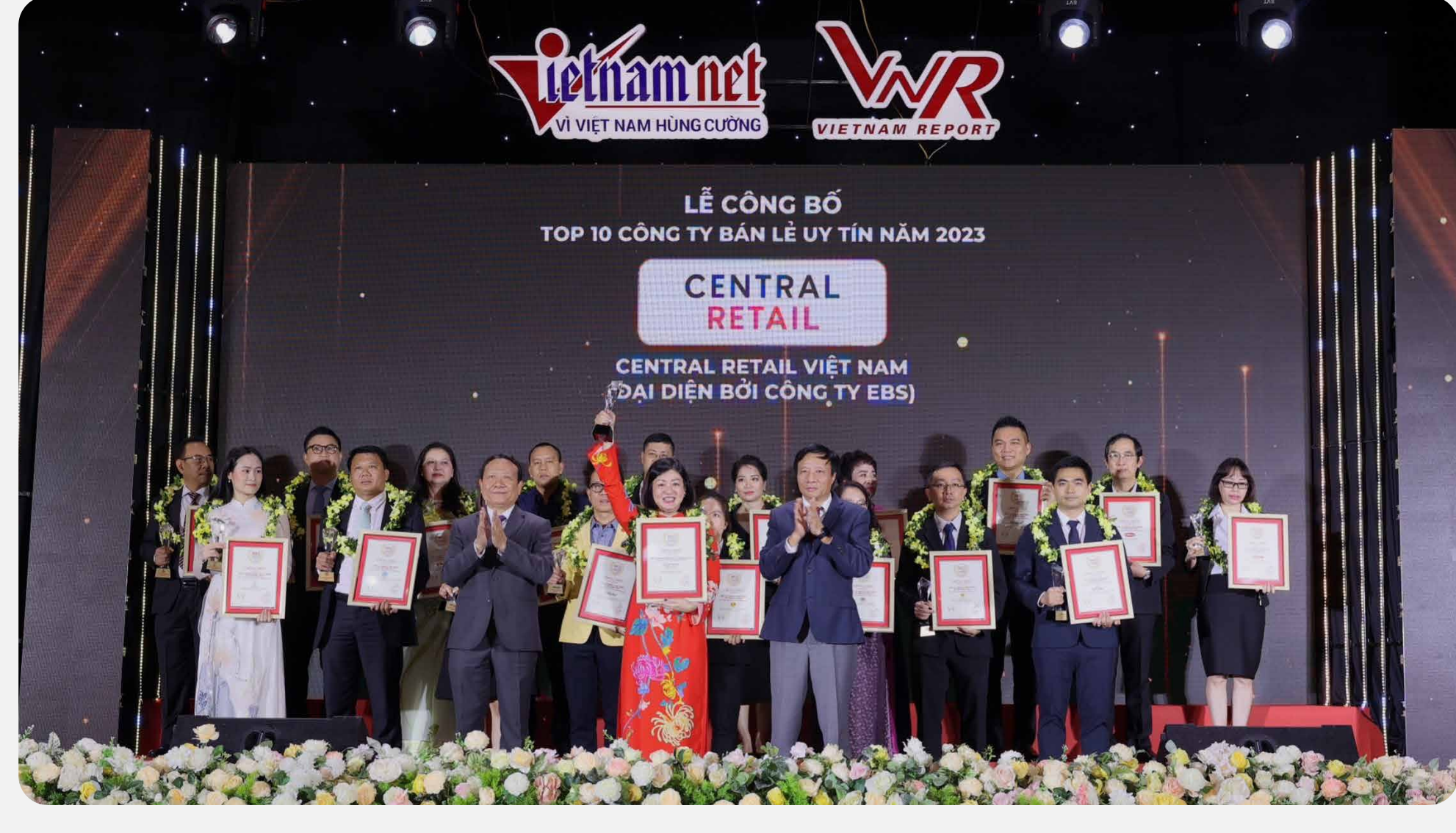
Central Retail Vietnam, secures top position Reputable Retail Company Award for the 3 rd consecutive year