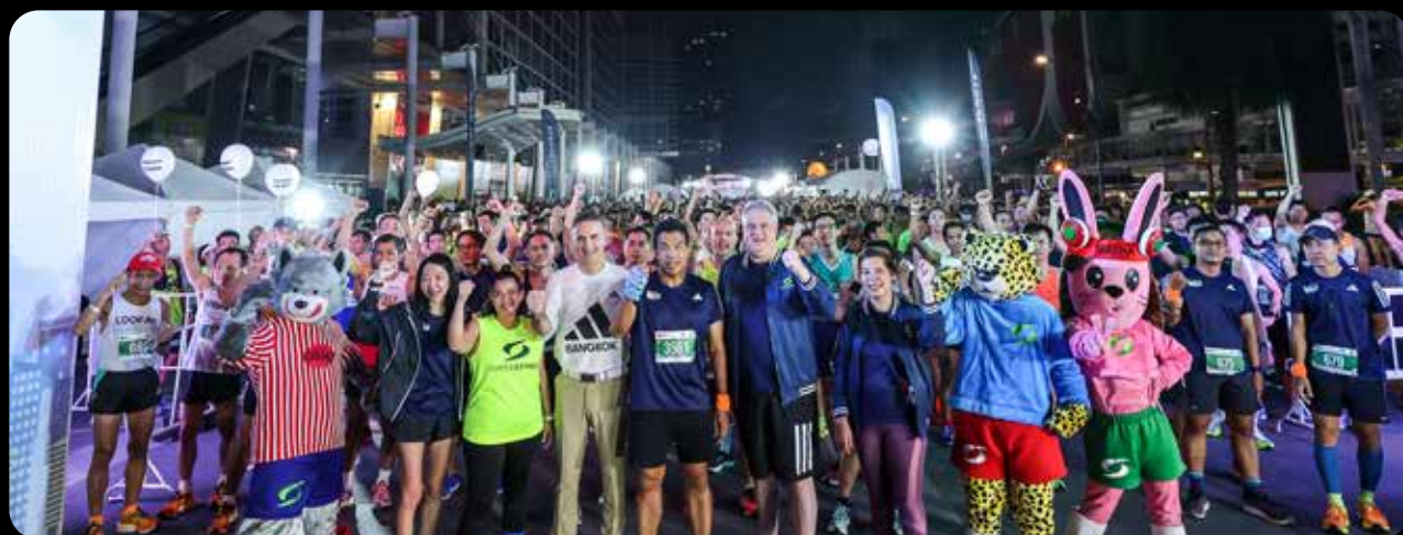
Supersports "10 Miles Run 2023 Thailand presented by Adidas" returned to revive the passion and spirit of over 8,000 runners in Bangkok