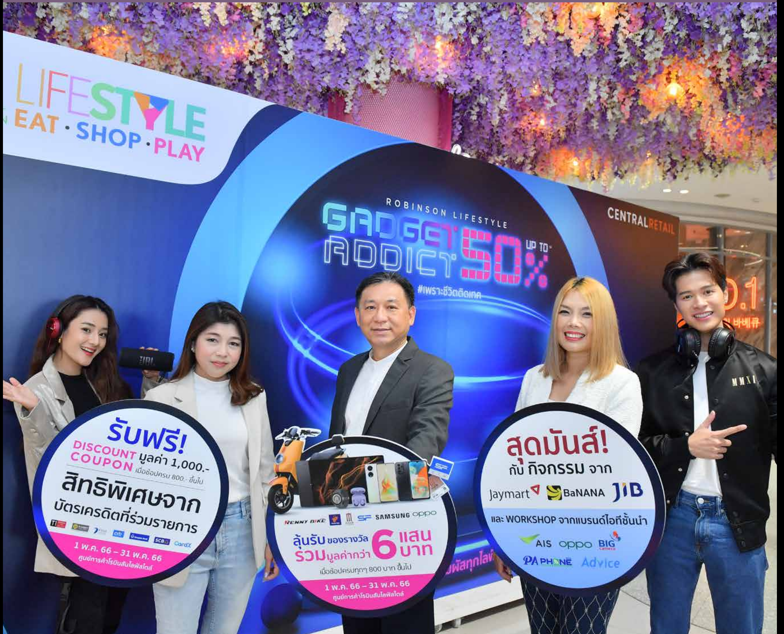
Robinson Lifestyle launches “ROBINSON LIFESTYLE GADGET ADDICT” campaign with exclusive deals for all lifestyles