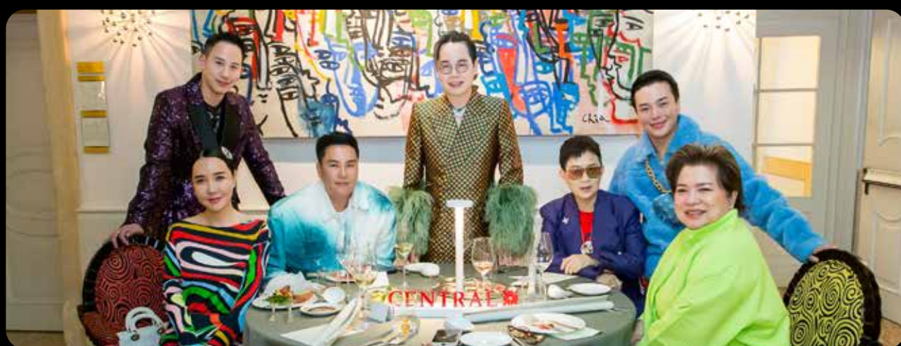
Central arranged a special Italy trip for VVIC to enjoy Italian culture and exclusive shopping experiences at La Rinascente