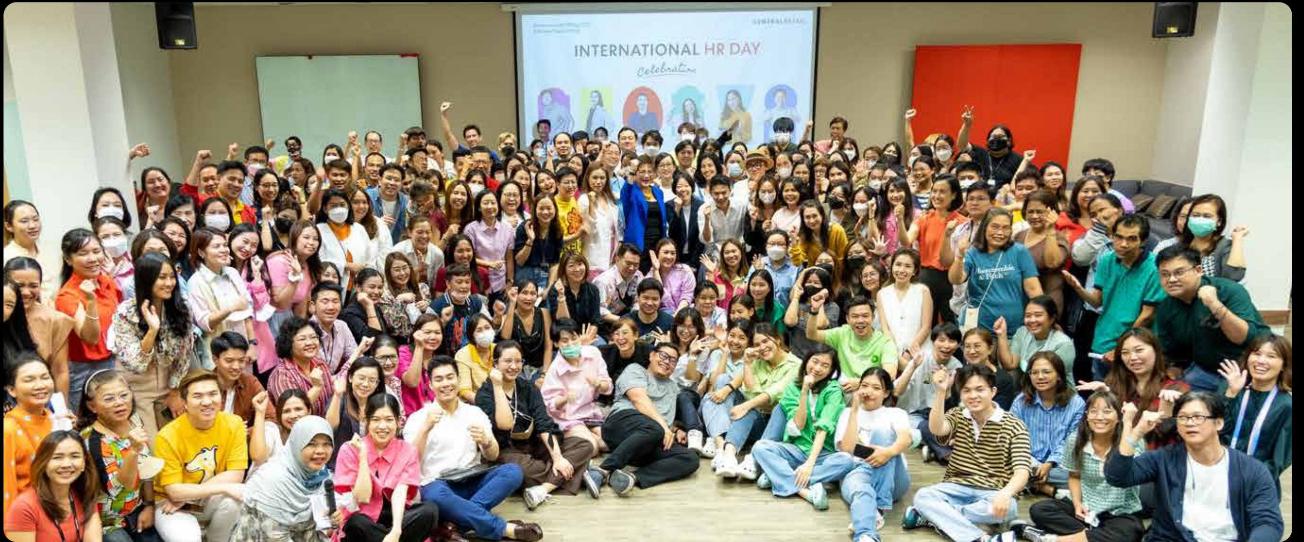
Central Retail HR Team joyfully celebrated International Day of HR 2023 with a lively “Colorful Unity” party featuring fun games and treats