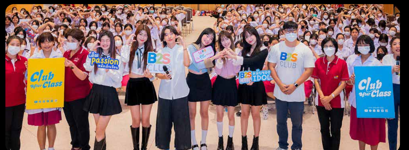
B2S x Club After Class promotes T-POP trend, transforming B2S CLUB into an after-school club for all