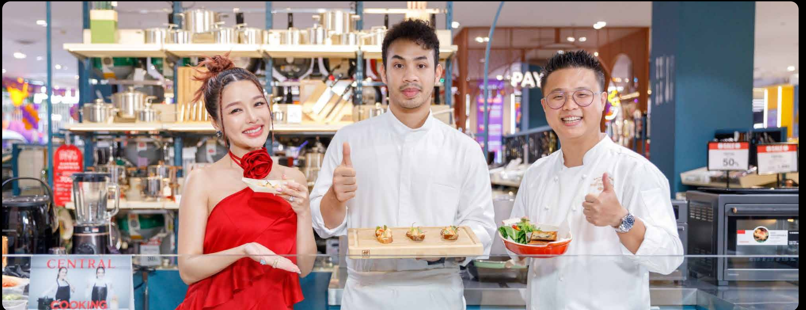
Central & Robinson, Thailand's kitchenware and home destination, present "CENTRAL COOKING TIME 2023" & "ROBINSON COOKING FAIR 2023"