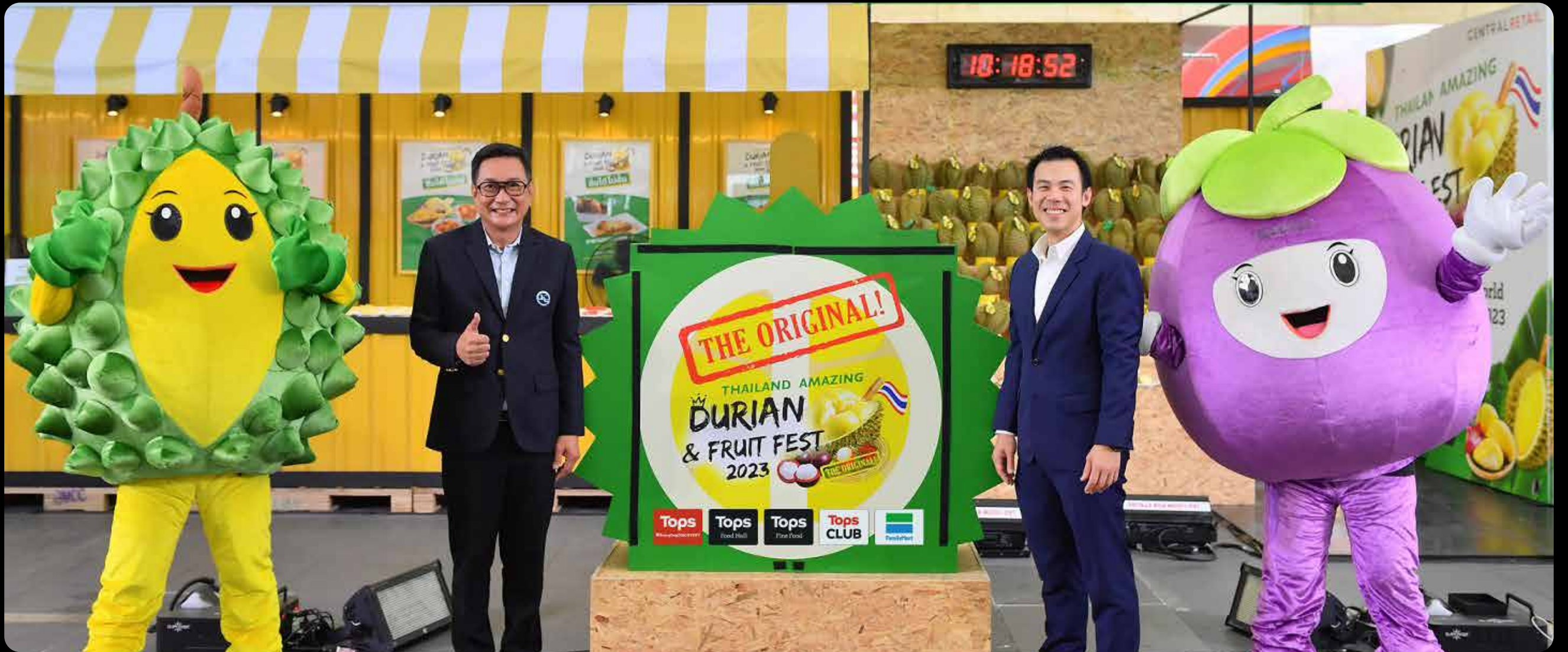
Tops, Thailand's 1 st durian buffet organiser, invites all to discover the charm of premium Monthong at "Thailand Amazing Durian & Fruit Fest 2023"