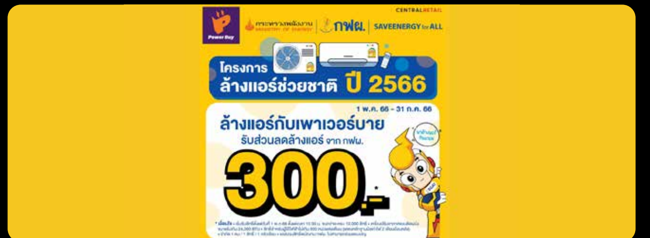
Power Buy and EGAT continue the “Clean your air, Care your life” project, offering THB 300 discount on air conditioner cleaning