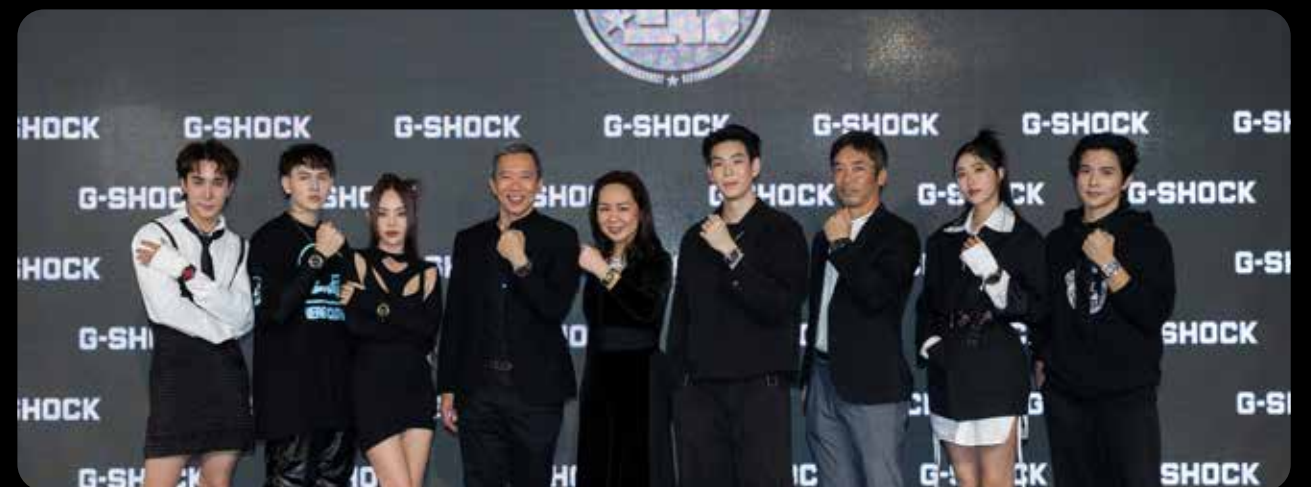
CASIO G-SHOCK celebrates 40th anniversary with "Challenge The Limits" concept with JJ Krissanapoom as friend of the brand