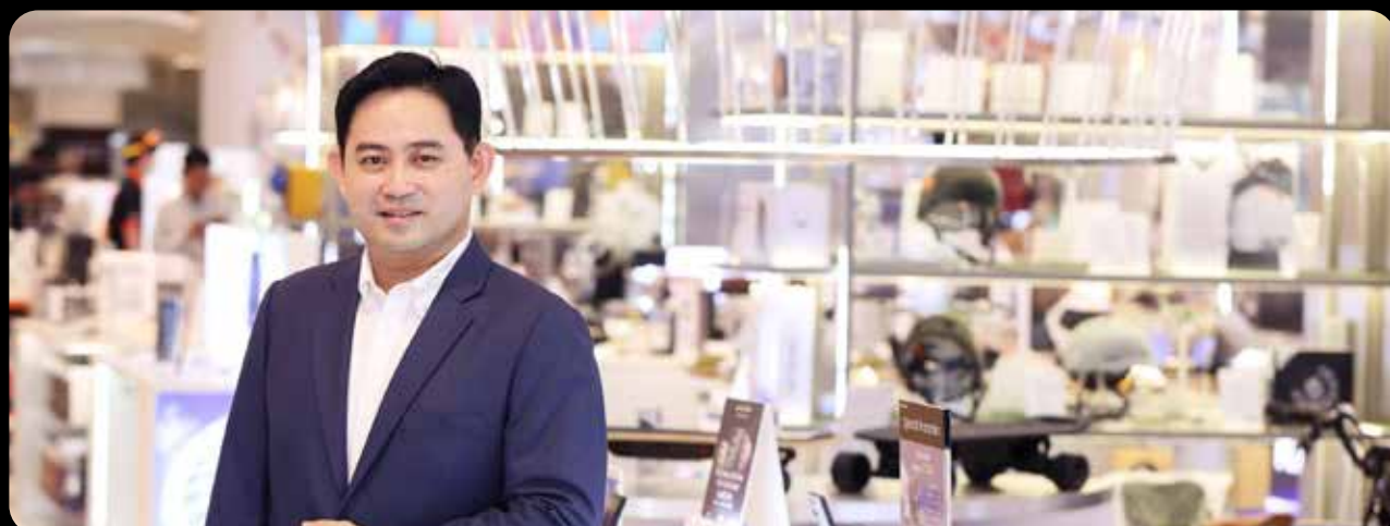
Power Buy announces aggressive brand strategy on the occasion of its 27 th anniversary