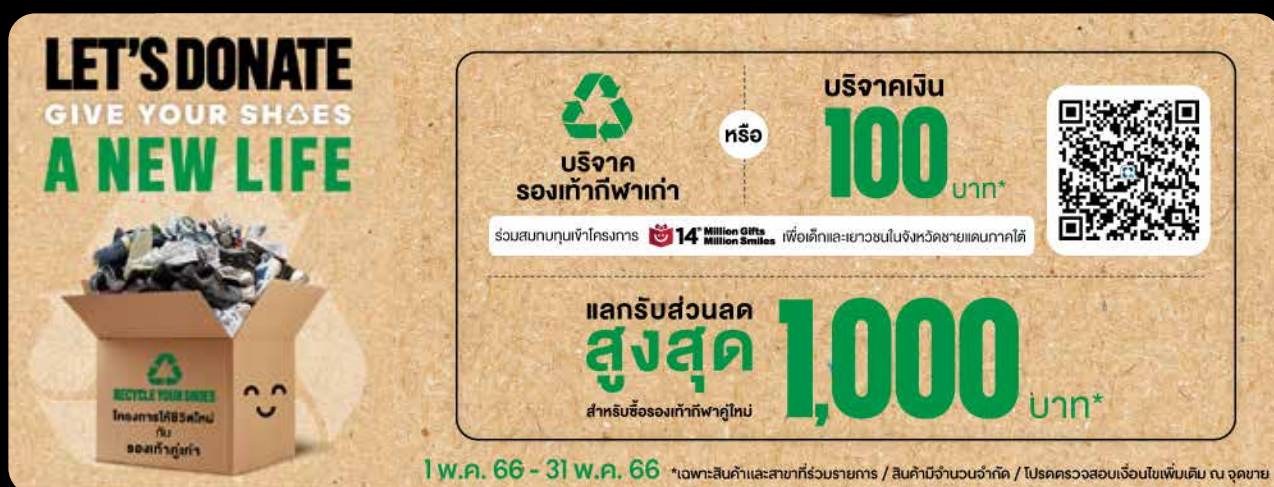
Supersports launches the 10th "Let's Donate! Give Your Shoes a New Life" campaign to support underprivileged youth in Thailand