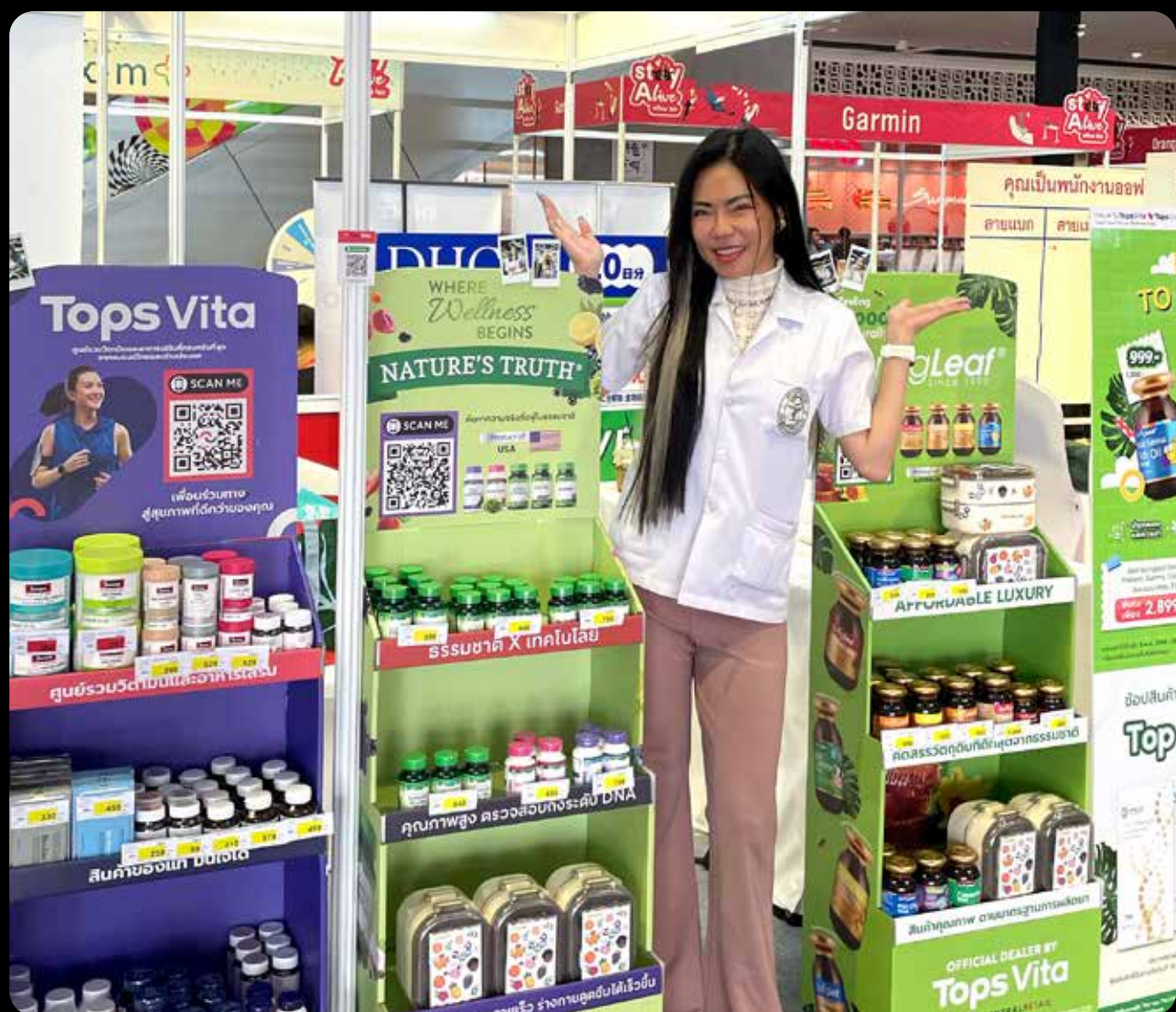
Tops Vita joined in "Stay Alive fair by AIA", at Samyan Mitrtown