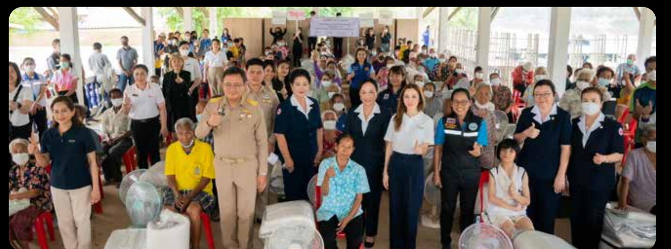
Robinson, together with Central Group, provides essential aid to flood victims in Ubon Ratchathani