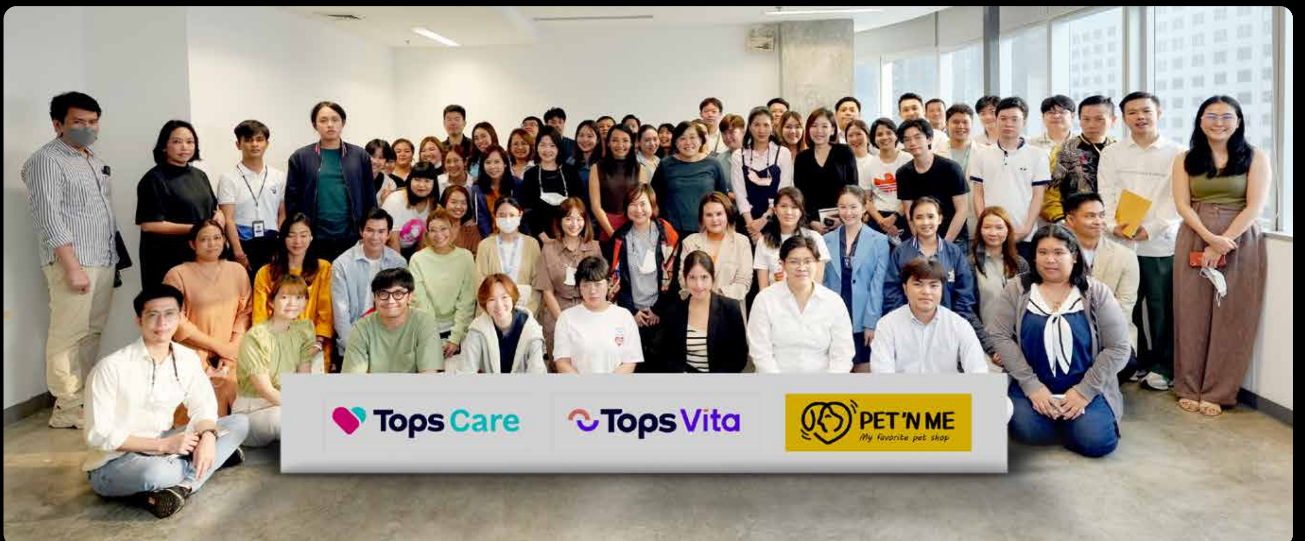
Tops Care, Tops Vita and Pet 'N Me organised a Town Hall activity to summarise 2022 performance and achievements