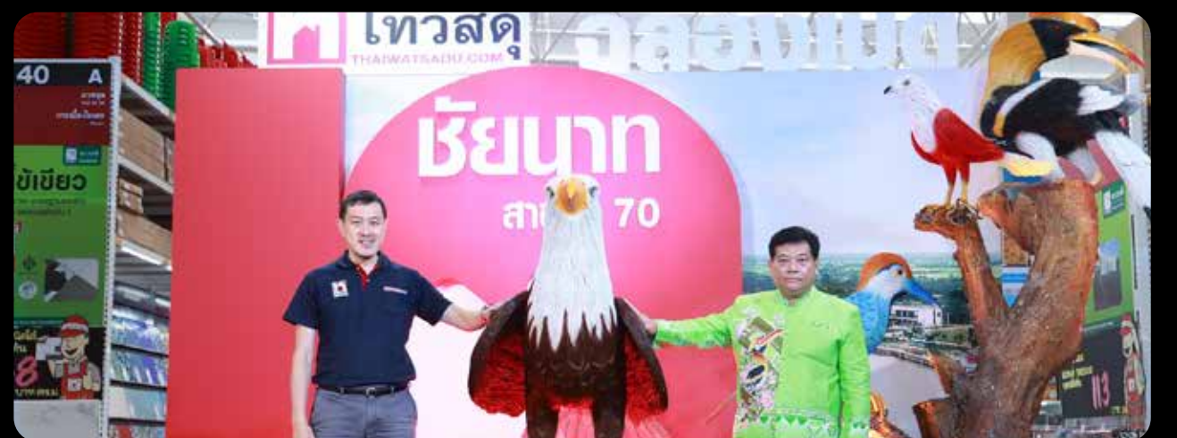
Grand opening of Thaiwatsadu's first branch in Chai Nat! Enjoy up to 60% off at our 70 th branch until May 14 th 2023