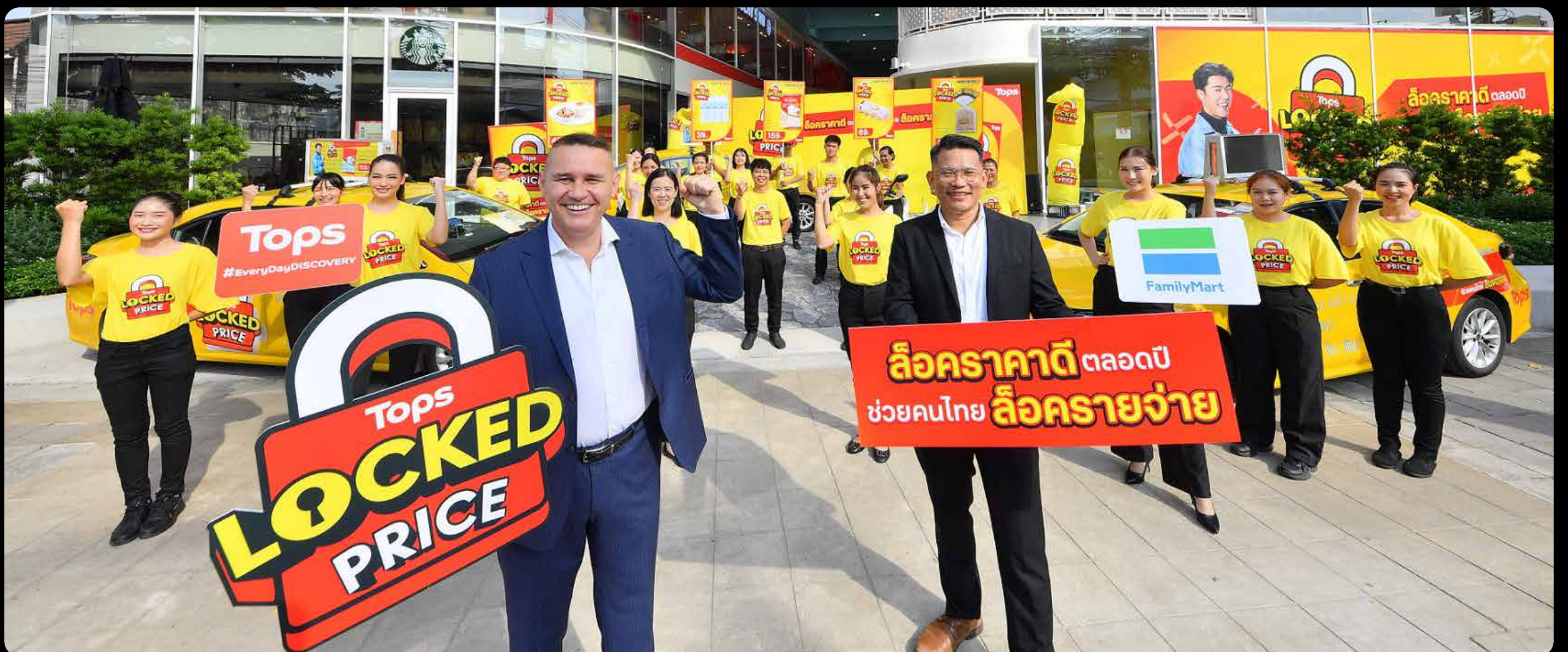
Tops kicks off "Tops LOCKED PRICE", the price stabilising campaign of the year to help Thais lower living costs, assuring a 1-year locked price