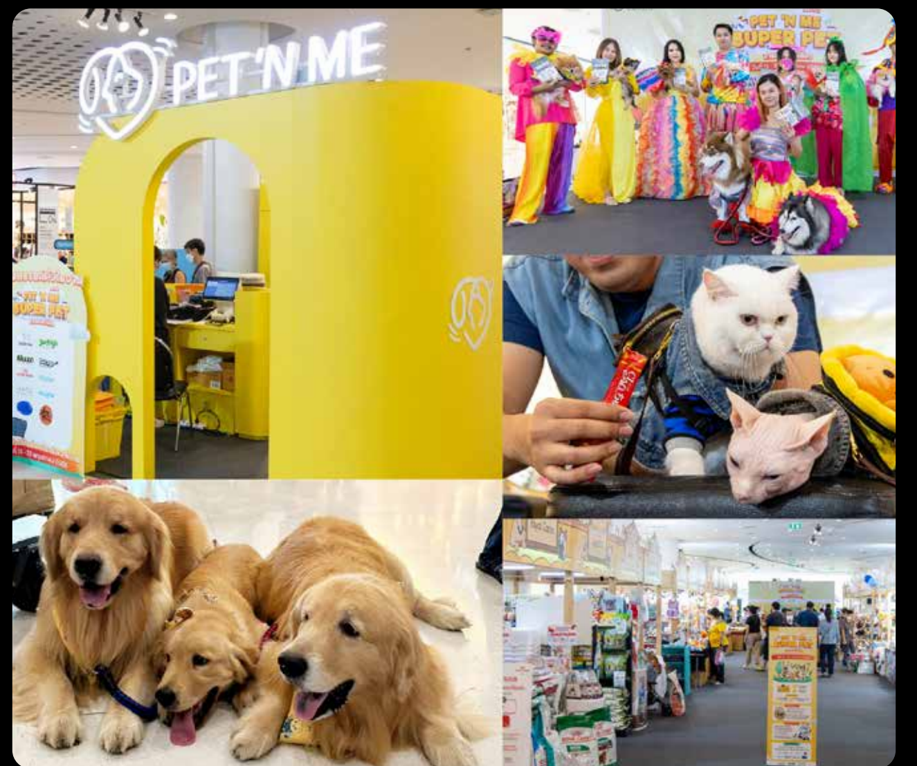
Pet 'N Me together with Central Westgate and Jerhigh host "PET 'N ME Super Pet" exclusively for pet lovers