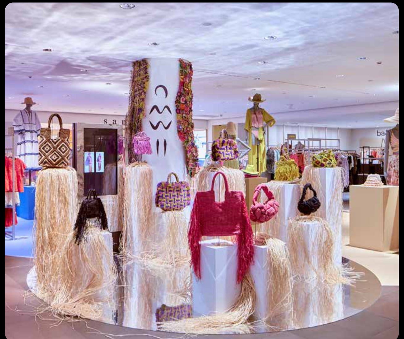
Rinascente welcomes the holidays season with beachwear selection, serving colourful summer fashion from exclusive brands