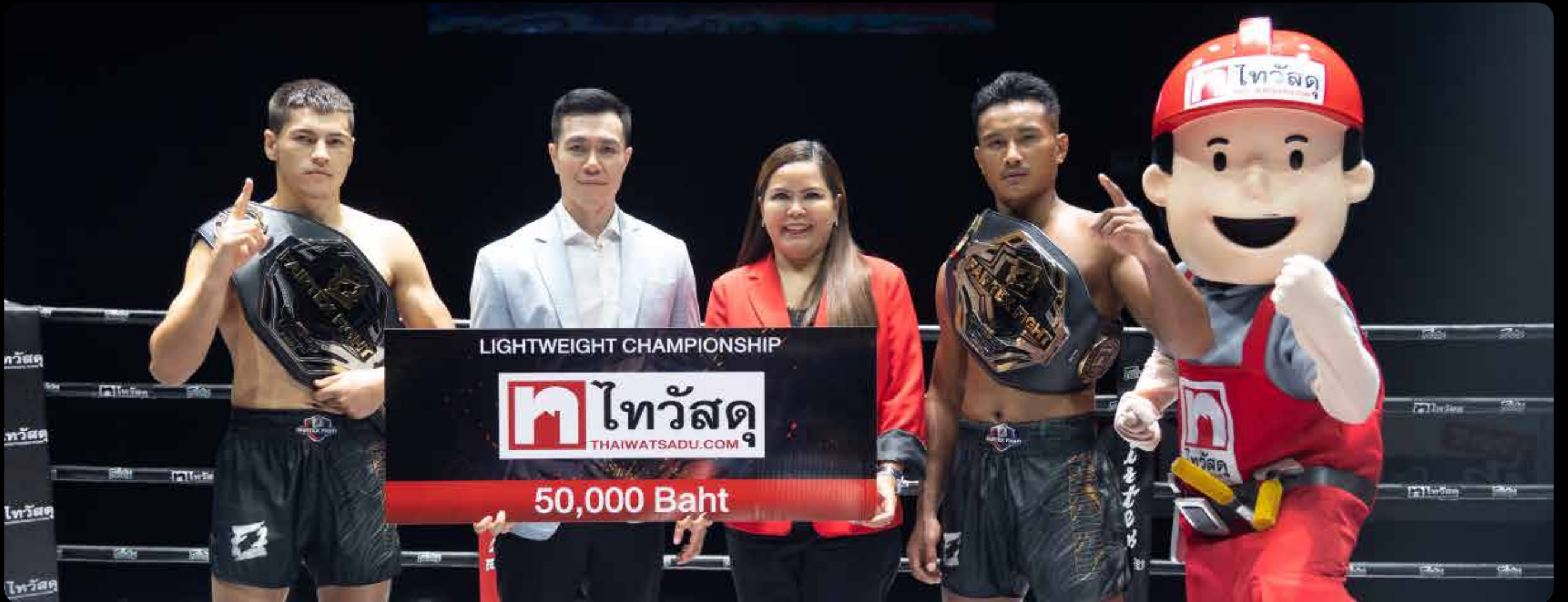
Thaiwatsadu offers over 1 MB prize for “Thaiwatsadu X Fairtex 4 Champions Tournament”