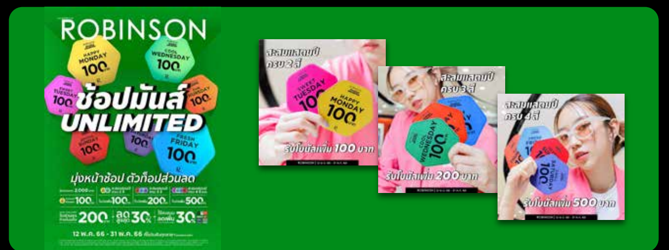
Robinson invites to shop with "Robinson Shop Mun Unlimited", offering big discounts, discount stamps, and more