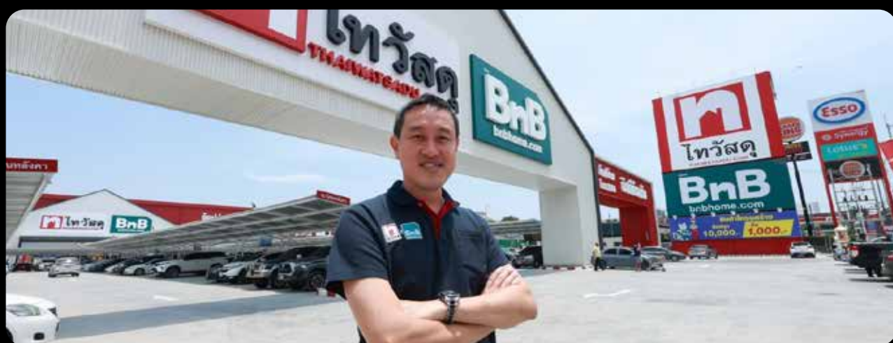
Thaiwatsadu takes over upper Bangkok, expanding its 71 st branch “Thaiwatsadu x BnB home Muang Ake”