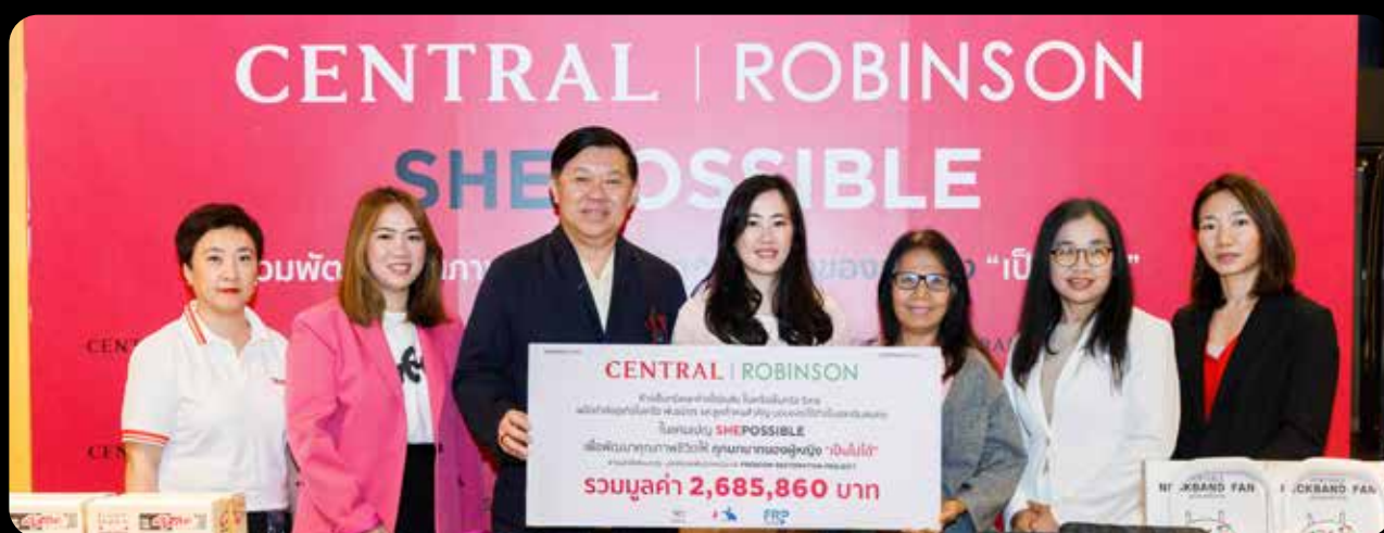
Central Group, Central and Robinson join forces with 8 artists and partners to empower women with essential item donations at "SHEPOSSIBLE"