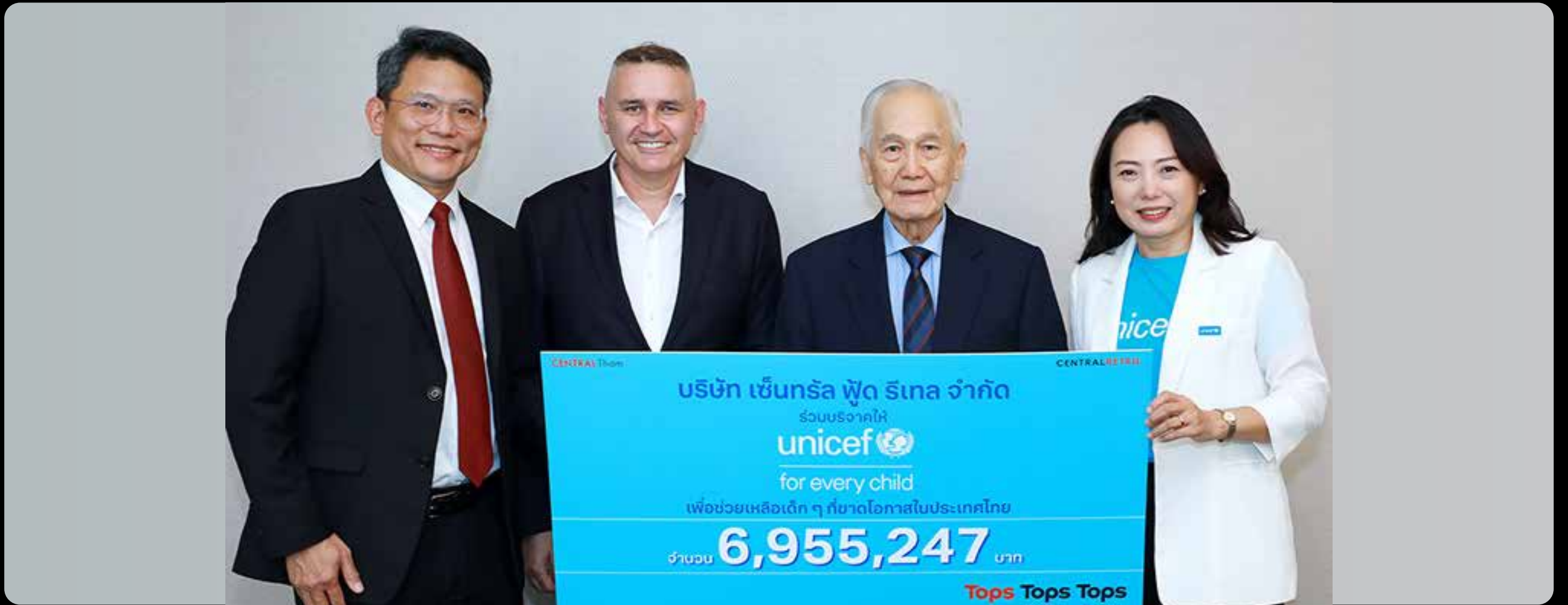
Tops x UNICEF "Every Child Can Read" project donates THB 6.9 million from inspired customers to elevate Thai children's literacy