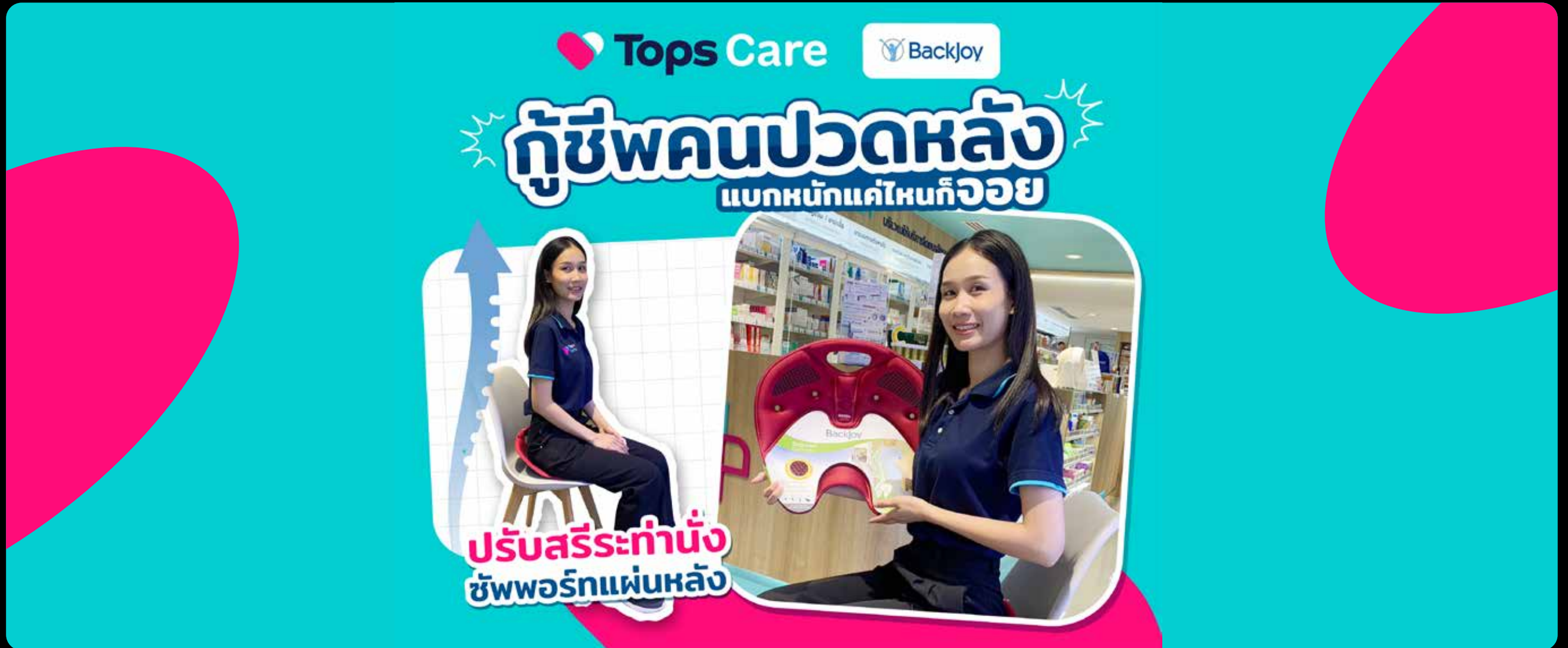
Tops Care presents BackJoy, a well-known health brand from America