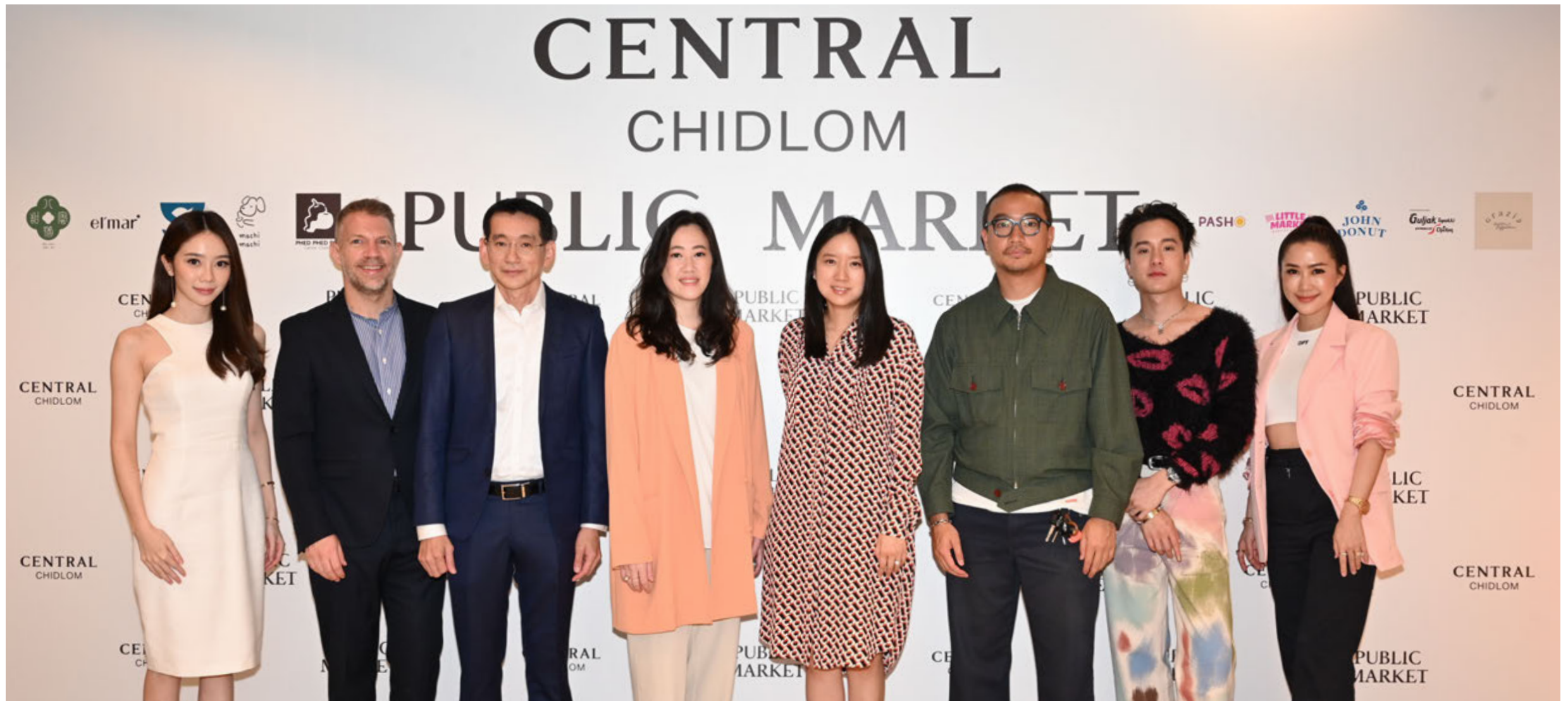
Explore “PUBLIC MARKET” at Central Chidlom, a new food community in the city with 10 talk-of-the-town eateries offering delicious flavors