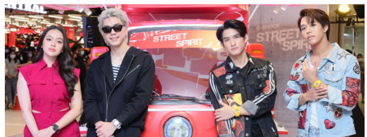
G-SHOCK launches the latest limited models at “G-SHOCK Street Spirit Fashion Truck 2022”