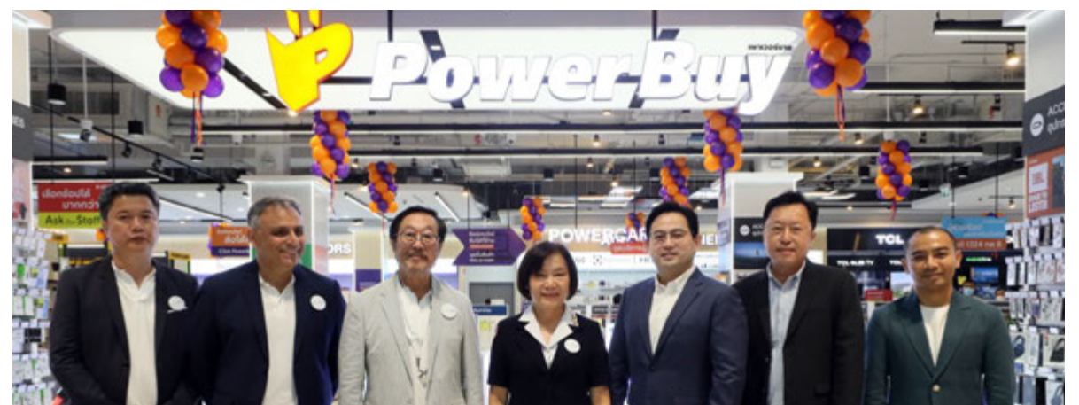
Power Buy opens "Power Buy Robinson Thalang" in Phuket to strengthen its top position as the leading electronic center