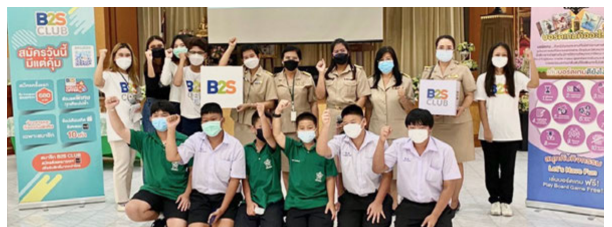
Bringing fun and joy to schools with B2S CLUB School Road Show