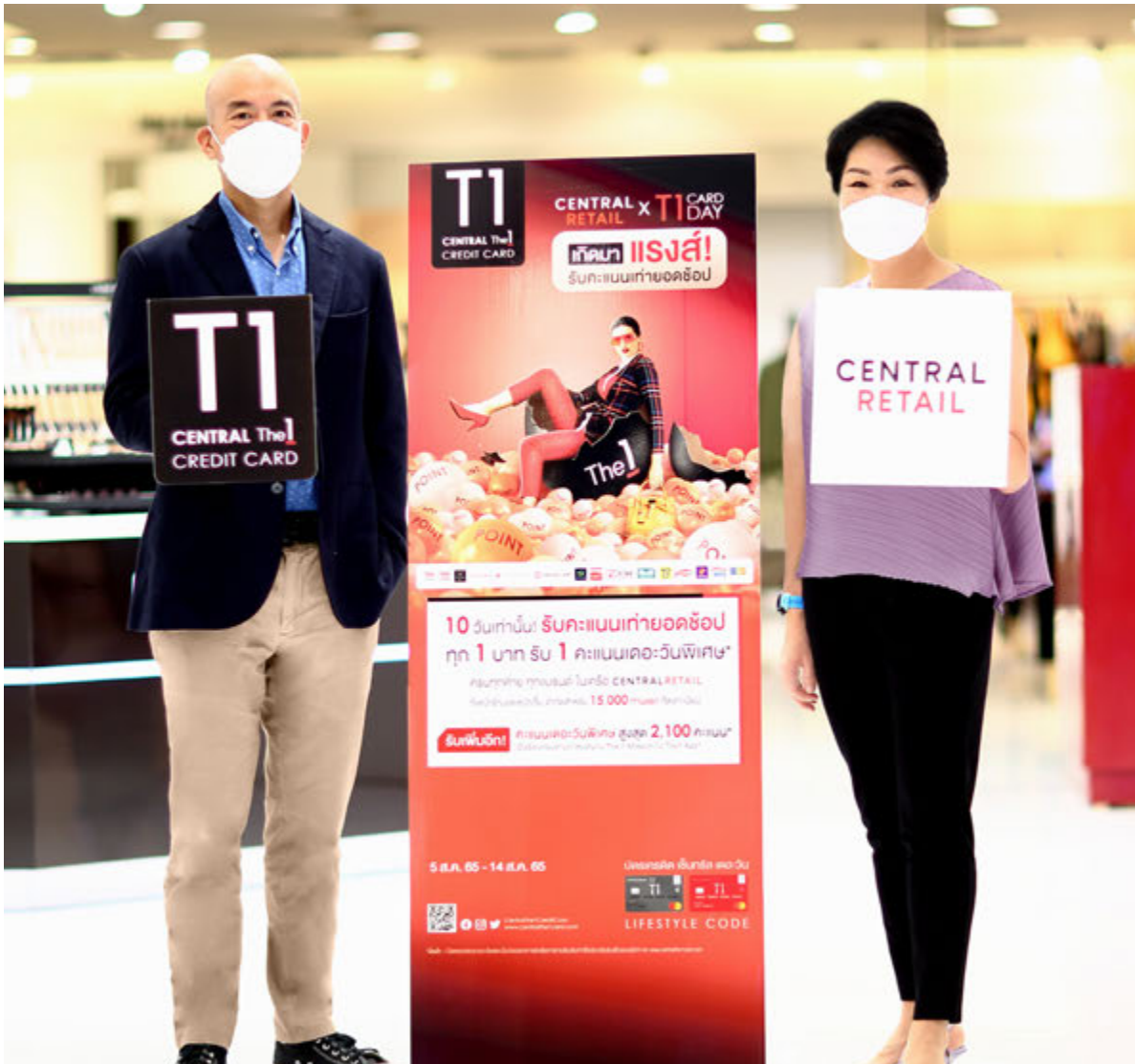
Central Retail with Central The 1 launches 'Central Retail x T1 Card Day', aiming for 680 MB spending throughout campaign