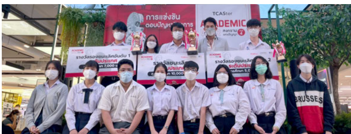
Promoting nationwide Academic Competitions organised by B2S CLUB x Tcacter x Central Pattana