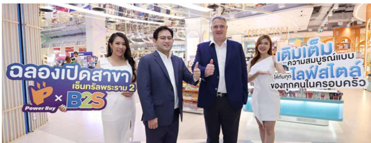
'Power Buy x B2S' Central Rama 2 reveals its new look into the technology and book hub targeting more than 20% increase in sales volume