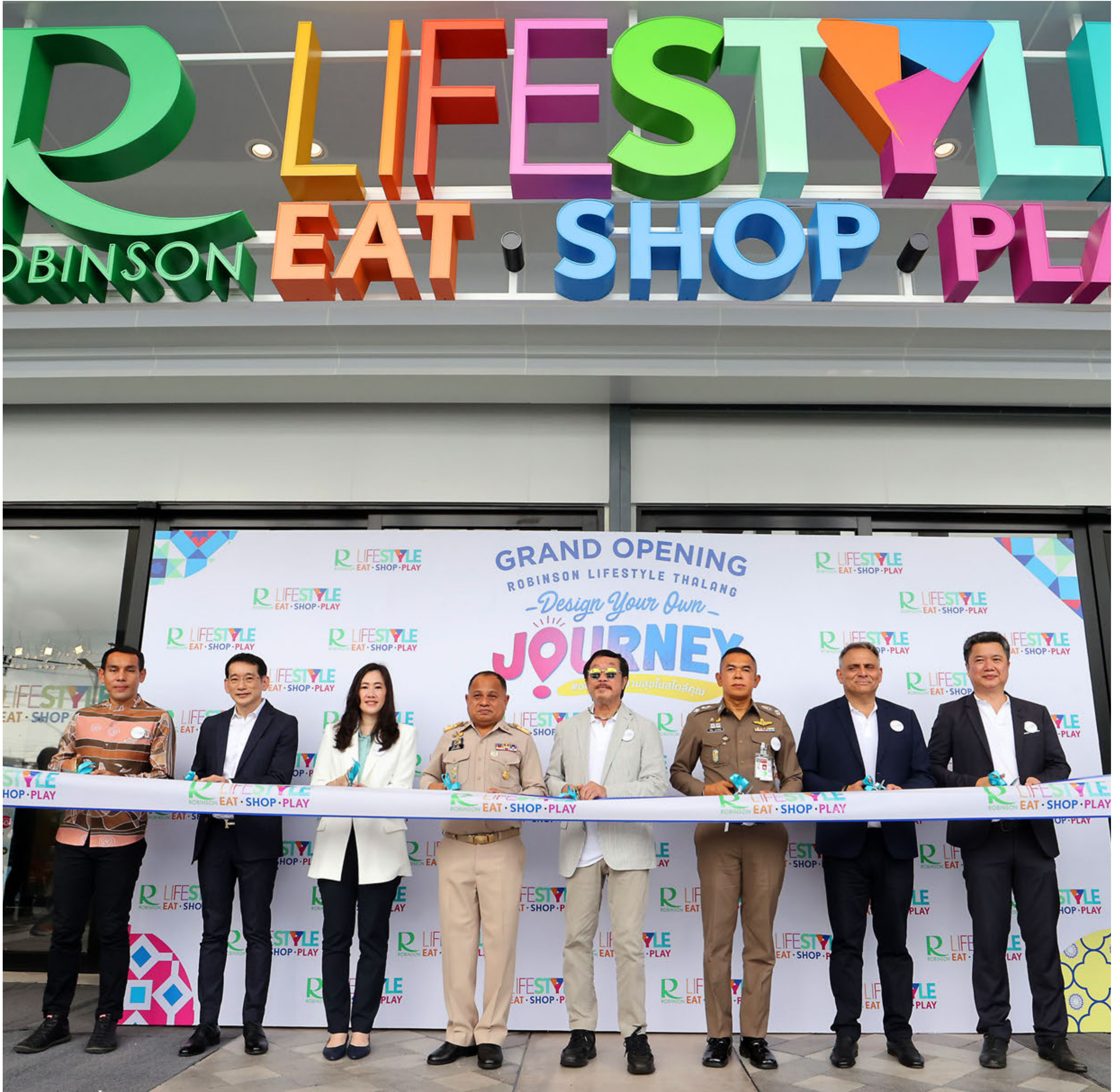
Strengthening its strategic location with a “WORLD-CLASS TOURISM DESTINATION” in a 1.1 billion Baht investment with the launch of Robinson Lifestyle and Robinson Department Store Thalang