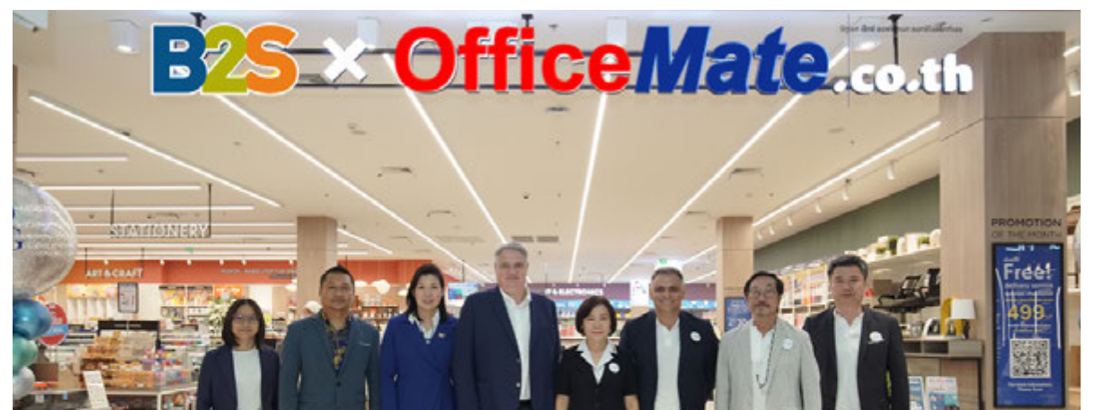
B2S x OfficeMate joins the opening of a new branch at Robinson Thalang Phuket, fulfilling happiness for every lifestyle