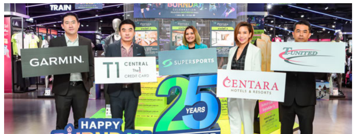
Supersports celebrates 25 years with the “Happy Burnday Celebration”