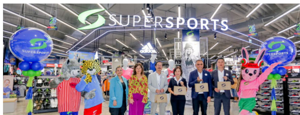
Supersports unveils its brand new store in Phuket set to be the leading sporting goods destination for locals and tourists