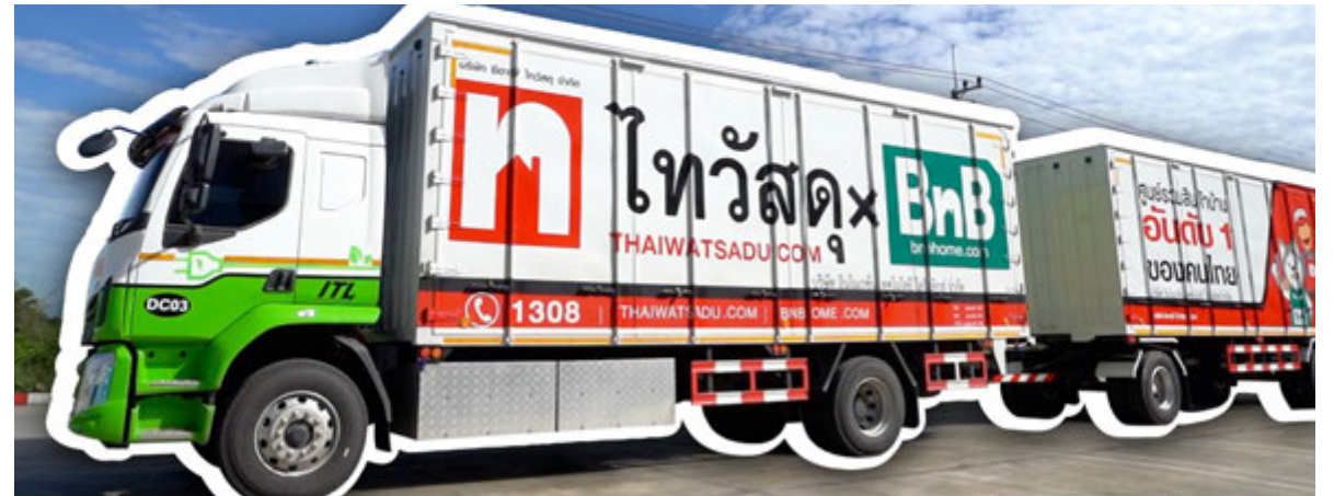
Thai Watsadu reinforcing Green Retail with EV logistics to drive a sustainable future