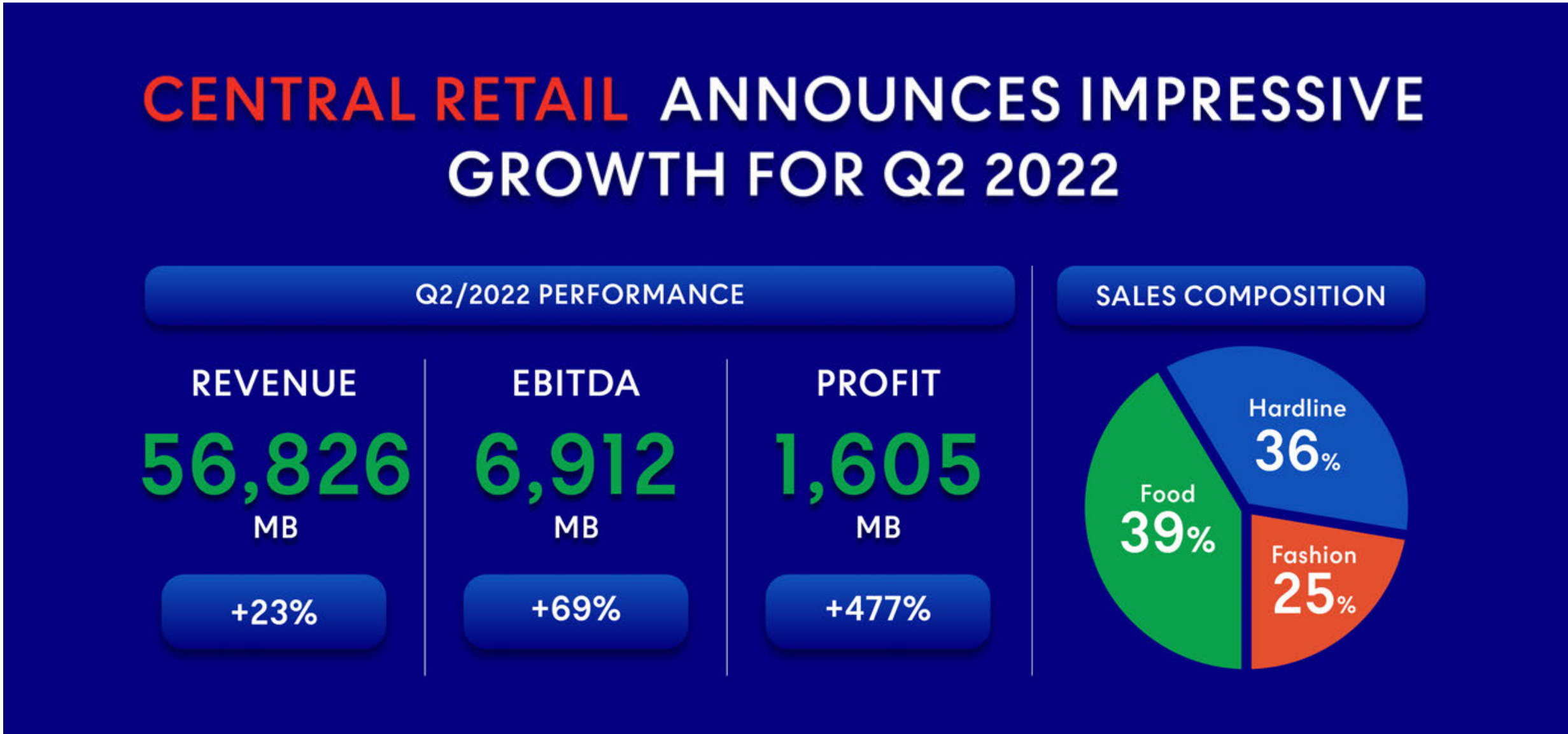
Central Retail announces impressive growth for Q2 2022 with a revenue of THB 56,826 million and a 23% growth