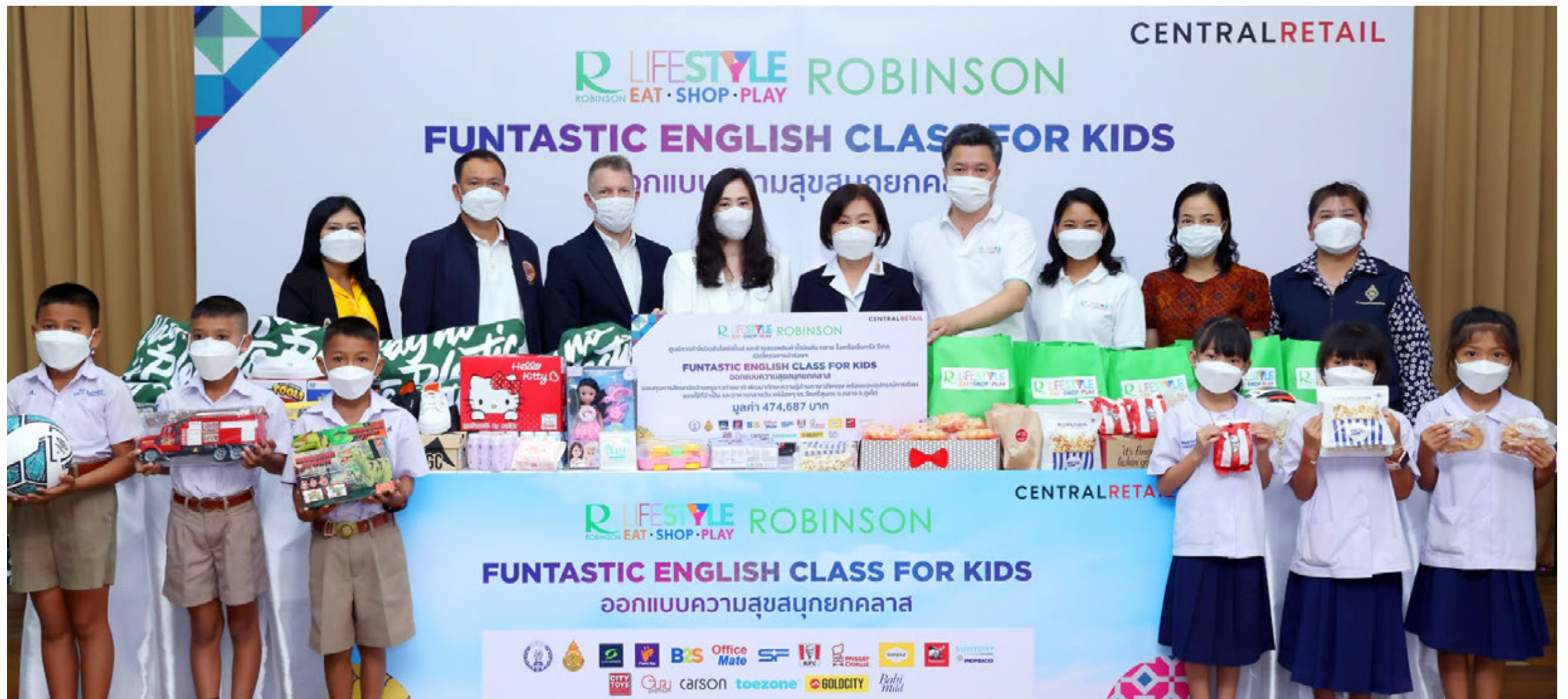
Robinson Lifestyle and Robinson Thalang together launch a pioneer project 'Funtastic English Class: Designing New Fun for the Whole Class'