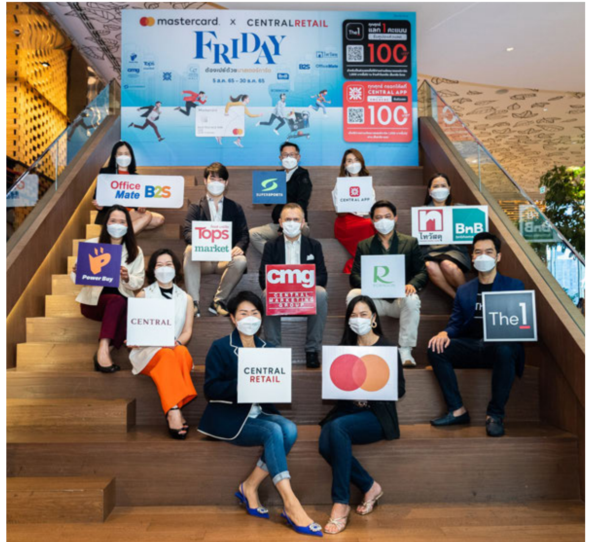
Central Retail in partnership with Mastercard return of the campaign FRIDAY-Pay with Mastercard, projecting to increase sales by 30%