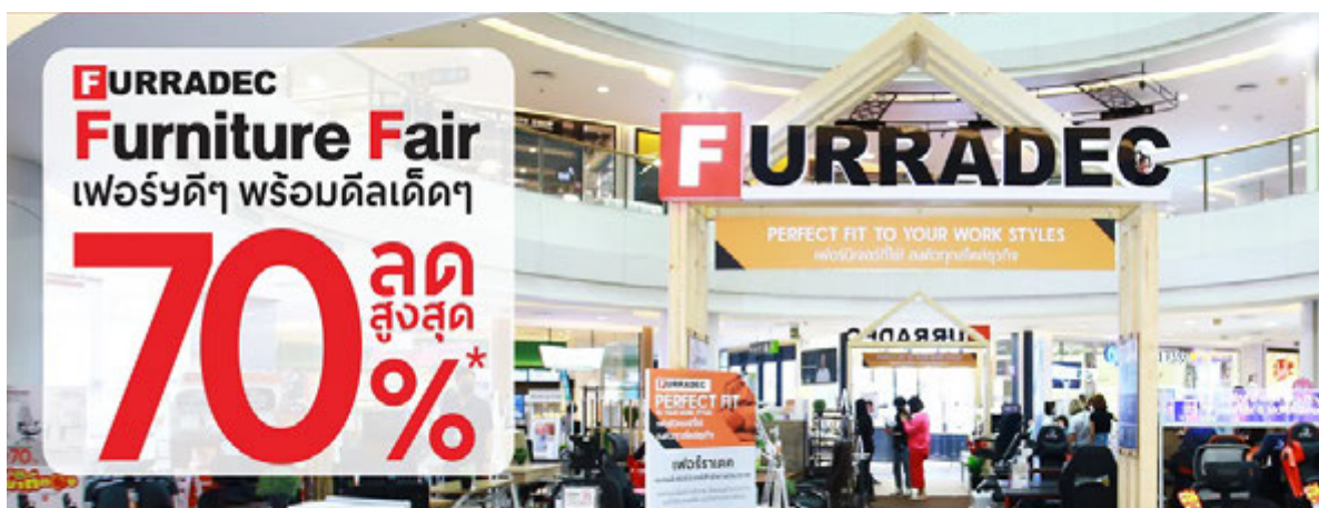
OfficeMate launches "Furradec Furniture Fair" with a variety of furniture to create personal working space with best deals up to 70%